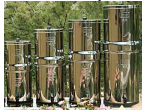
Big Berkey Royal Imperial Crown

New Black Berkey's Listed Below Produce 99.9999% Pure Drinking Water